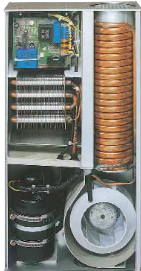
Rotary piston compressors ensure optimal performance.