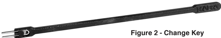
Figure 2 - Change Key