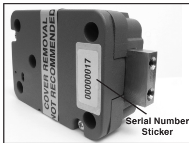
Figure 1 - Serial Number Label

The 8-digit lock serial number is located on a removable sticker on the lock case (See Figure 1.) Which is designed for the security professional in charge of this lock to peel off and place on the proper form. Since you may need the serial number of the lock to reset it if the combination is lost or forgotten and the door is open, it is important that you keep a record of the lock serial number in a secure place.