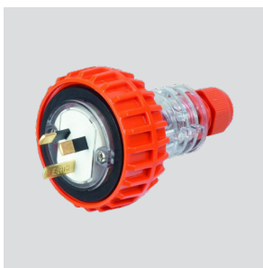
Screw Lock Plug 10A 3 Flat Pin (AS3112)