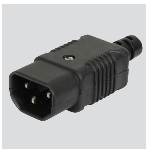
IEC C14 10A Plug (60320)