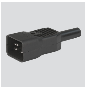
IEC C20 15A Plug (60320)