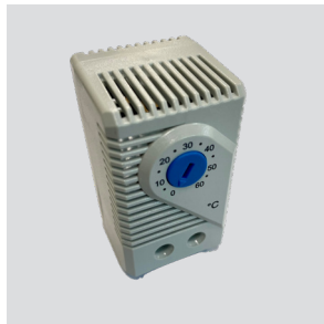
Thermostat 240V AC -20 +80°C