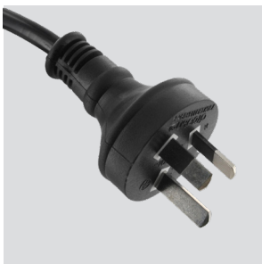
AUS Outlet Moulded 3 pin Plug